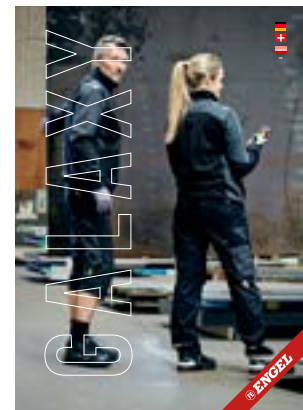
BROSCHÜRE GALAXY only online