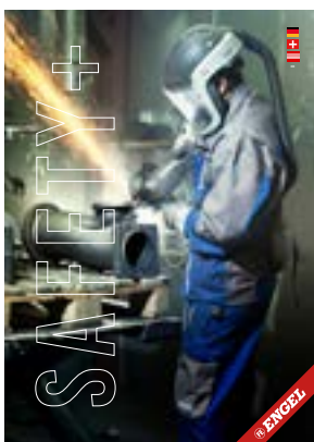
BROSCHÜRE SAFETY+ 199-953