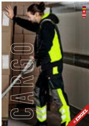
BROSCHÜRE CARGO only online