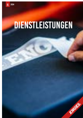
DIENSTLEISTUNGEN € 199-931