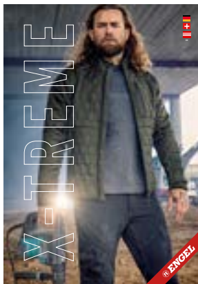
BROSCHÜRE X-TREME 323